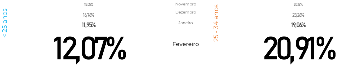
Variação período homólogo 2020 - 2021 (2019-2020)